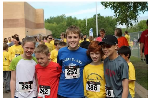
Getting ready for the 5K!