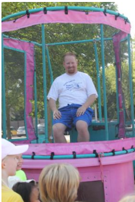
Awaiting first pitch

Thanks to all the volunteers and staff who helped make this event fun and enjoyable for all and to the families that decided to share their Saturday afternoon with friends at school!