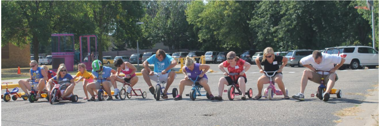
Determined staff members ready for competition at the start of the trike race