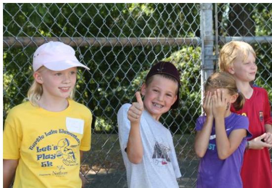
Lined up waiting for a turn at kickball